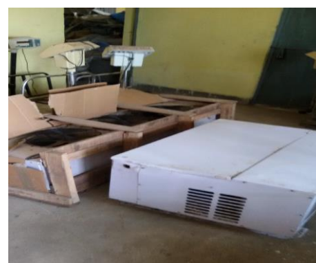
Non installation of cooling equipment at Sargipali

Rule 45-A (xii) and 82 of OAPM Rules, 1958 stipulate creation of storage for unsold agricultural produce. To avoid distress sale and to preserve unsold vegetables, 17 cooling chambers were procured during 2003-04 and five cooling chambers procured in subsequent years at a cost of ₹ 1.04 crore for installation in 16 market yards under 15 20 RMCs. Audit noticed that 20 cooling chambers were