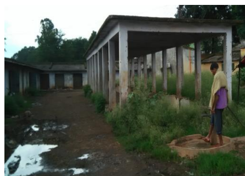
Non functional KB at Semiliguda

It was noticed in audit that 15 19 out of 43 KBs were not functional since the date of inception due to isolated locations, insufficient marketable vegetables etc. Remaining 28 KBs function with middlemen/traders. 14 of them function once a week, six of them function twice a week instead of daily basis and balance eight KBs function daily. Hence, expenditure of ₹ 2.94 crore incurred on these non functional KBs was rendered unfruitful and farmers/consumers could not avail the benefits of programme.