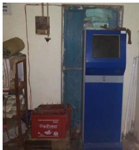
Non functional IT Kiosk at Nabarangpur RMC

Accepting the observations of audit, Government stated (October 2015) that the concerned RMCs had been instructed to look into this aspect and take corrective measures and make the PTBs function.